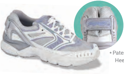
X532W Color: Periwinkle