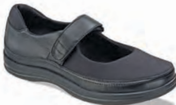
A350W Color: Black