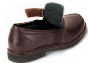
LT210M Color: Brown

Fully functional vamp opens all the way for easy foot insertion.