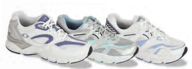
X521W Color: Periwinkle