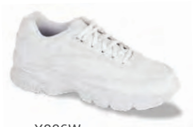
X826W Color: White