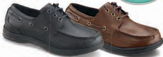
A1000M Color: Black

This footwear exceeds SATRA and Mark II slip resistant standards for dry, wet and oily surfaces!