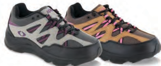
V753W Color: Grey/Purple