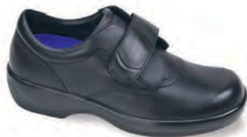
B3000W Color: Black