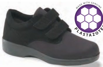
1200W Color: Black