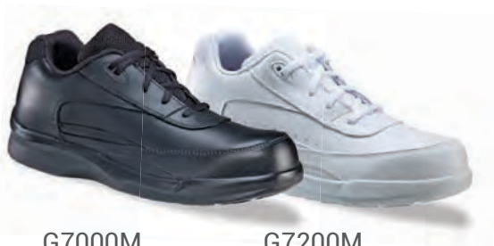
G7000M Color: Black