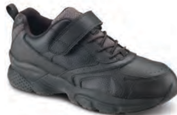
A6000M Color: Black