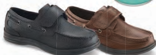
A2000M Color: Black

This footwear exceeds SATRA and Mark II slip resistant standards for dry, wet and oily surfaces!