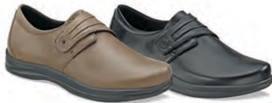
A832W Color: Taupe