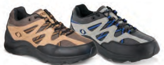
V751M Color: Brown