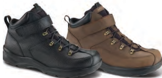
A4000M Color: Black