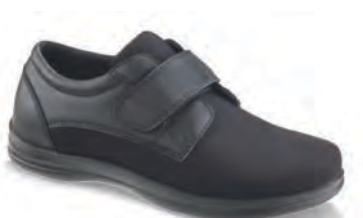
A3000W Color: Black