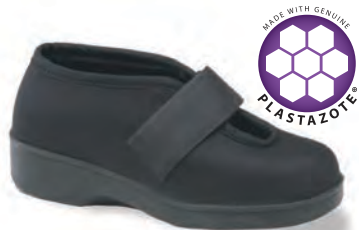
1201W Color: Black