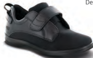
A3200M Color: Black

Sizes: 7-13, 14, 15 Widths: M, W, XW Depth: 5/16"