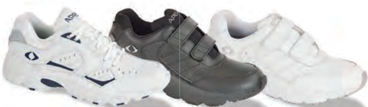
V854M Color: White/Blue