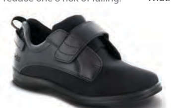
A3200W Color: Black

* References available at www.apexfoot.com/mbs/references