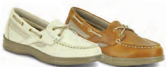
A2300W Color: Bone