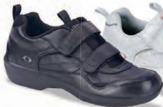
G8010W Color: Black