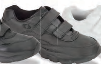
X920M Color: Black