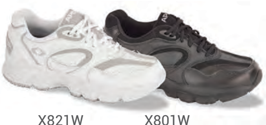
X821W Color: White/Grey