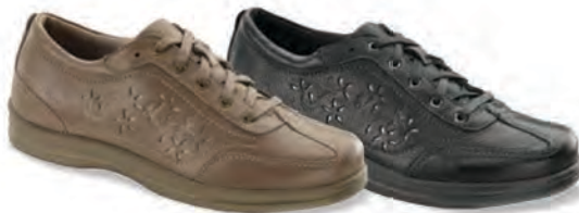
A543W Color: Tan