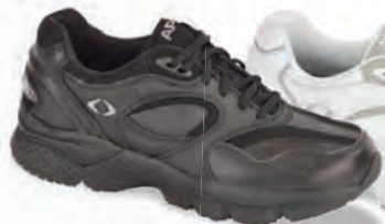
X801M Color: Black