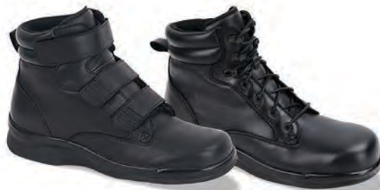
B4200M Color: Black (6" Triple Strap)