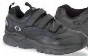
X903M Color: Black