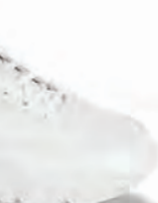
X826M Color: White