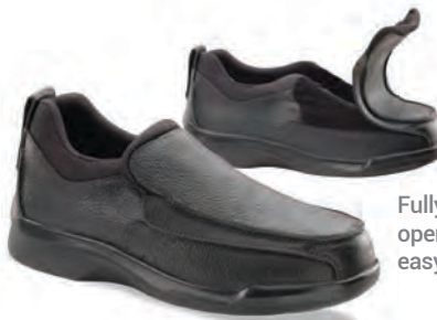
B5000M* Color: Black

Fully functional vamp opens all the way for easy foot insertion.