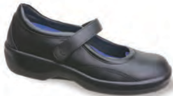
B6000W Color: Black