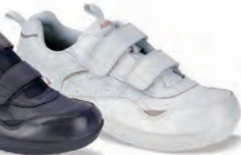
G8210W Color: White