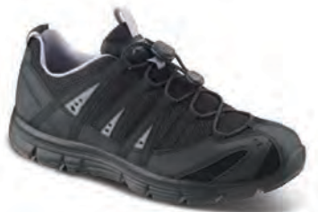
A5000M Color: Black

Widths: Medium (C/D), Wide (E/2E), X-Wide (3E/4E)