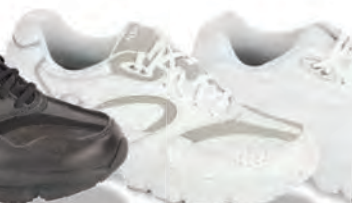
X821M Color: White/Grey