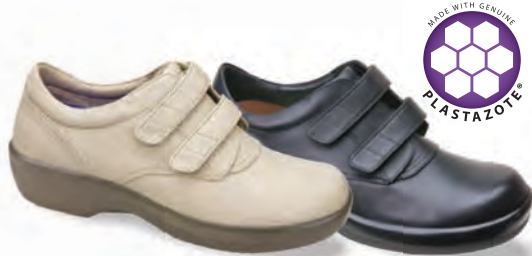
1264W Color: Taupe

Width: Medium (B/C), Wide (D/E), X-Wide (2E/3E)