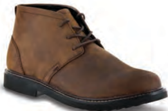
LT410M Color: Brown