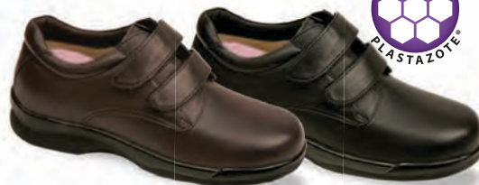
1261M Color: Brown