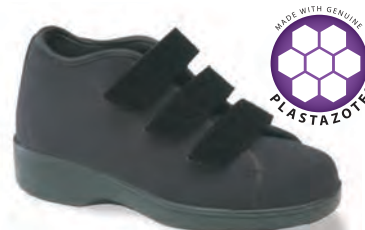
1209W* Color: Black

*Only available in right or left singles