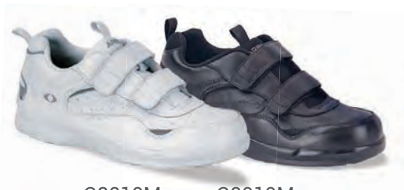
G8210M* Color: White