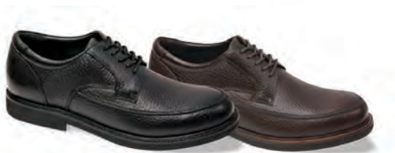
LT900M Color: Black