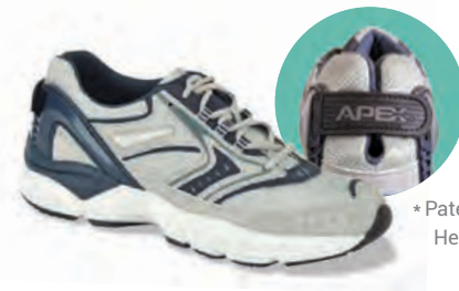
X532M* Color: Blue