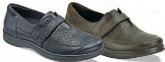
A700W Color: Black