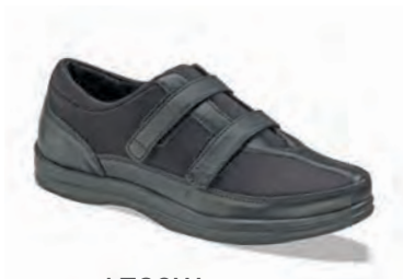
A730W Color: Black