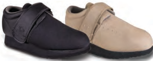
T2000 Color: Black