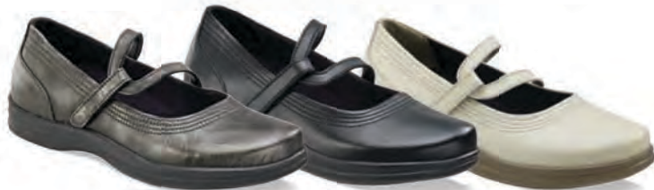
A301W Color: Pewter

Widths: Medium (B/C), Wide (D/E), X-Wide (2E/3E)