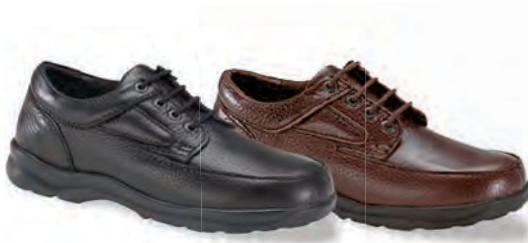
Y900M Color: Black