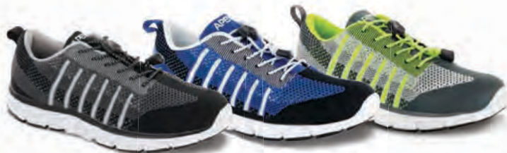
A7000M Color: Black