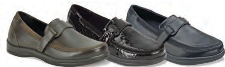
A215W Color: Dark Brown