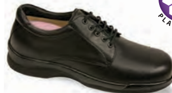
1270M Color: Black

Sizes: 6½-13, 14, 15, 16 Width: Medium (B/C), Wide (D/E), X-Wide (2E/3E)