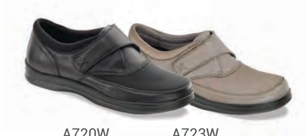
A720W Color: Black