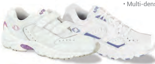
V952W Color: White