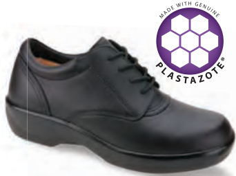
1270W Color: Black