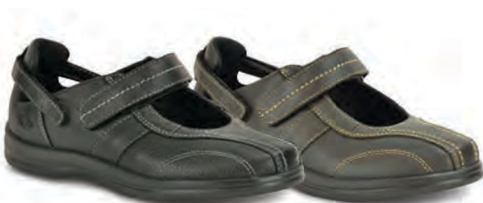
A340W Color: Black