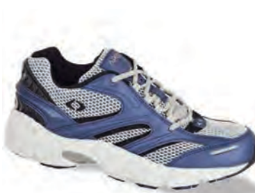
V551M Color: Blue