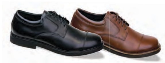
LT600M Color: Black