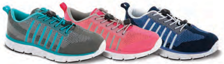
A7000W Color: Grey