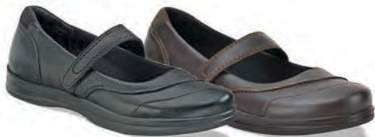
A330W Color: Black