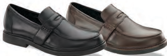
LT200M Color: Black