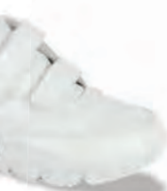
X926M Color: White