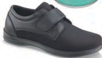
A3000M Color: Black

This footwear exceeds SATRA and Mark II slip resistant standards for dry, wet and oily surfaces!