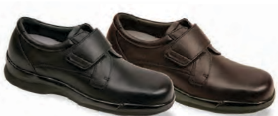
B3000M* Color: Black